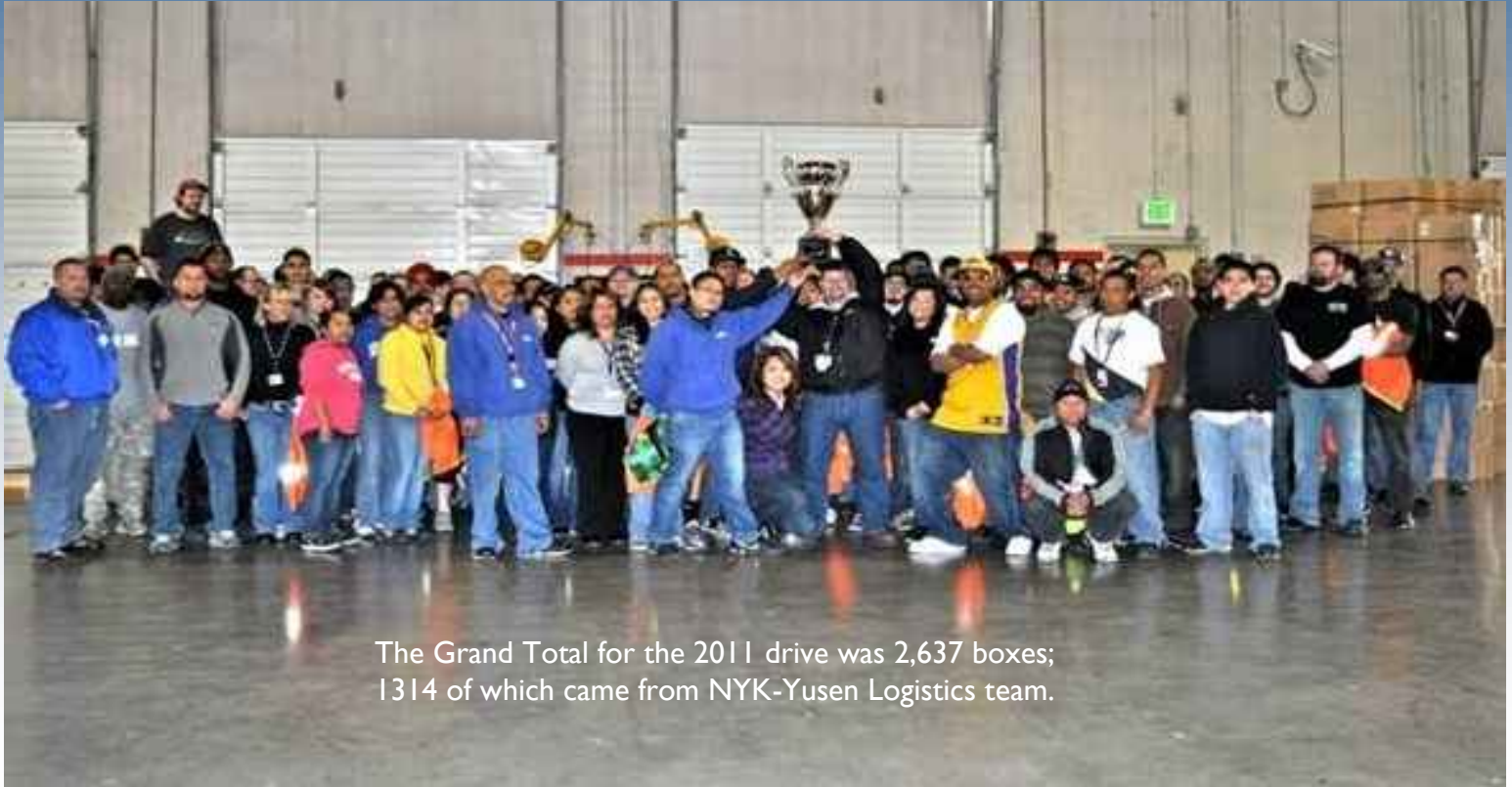
The Grand Total for the 2011 drive was 2,637 boxes; 1314 of which came from NYK-Yusen Logistics team.

THANK YOU to NYK Logistics for the incredible job of gathering and donating the winning number of Children's themed bandages for this year's Transportation Club of Tacoma 2011 Bandage Drive!