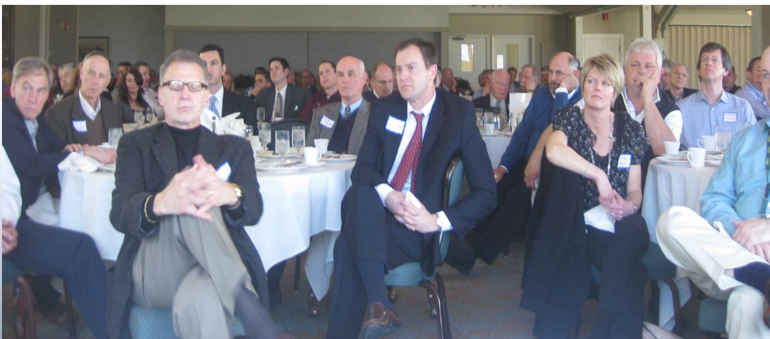
2011 Seattle and Tacoma Joint Transportation Clubs Meeting